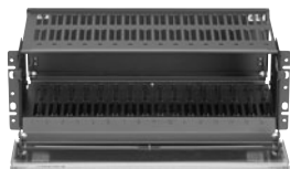
AX100934 FiberExpress Manager Shelf