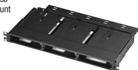
AX101943 FiberExpress Manager 1U Rack Mount Patch Panel

FiberExpress modules are rack-mounted using FiberExpress manager shelves. The shelves provide the total system with extra high connection density while facilitating cable routing and patch cord management. For 19" (0.48 m) or 23" (0.58 m) h rack: 19" (0.48 m) shelf holds up to 12 modules; 23" (0.58 m) shelf holds up to 16 modules.